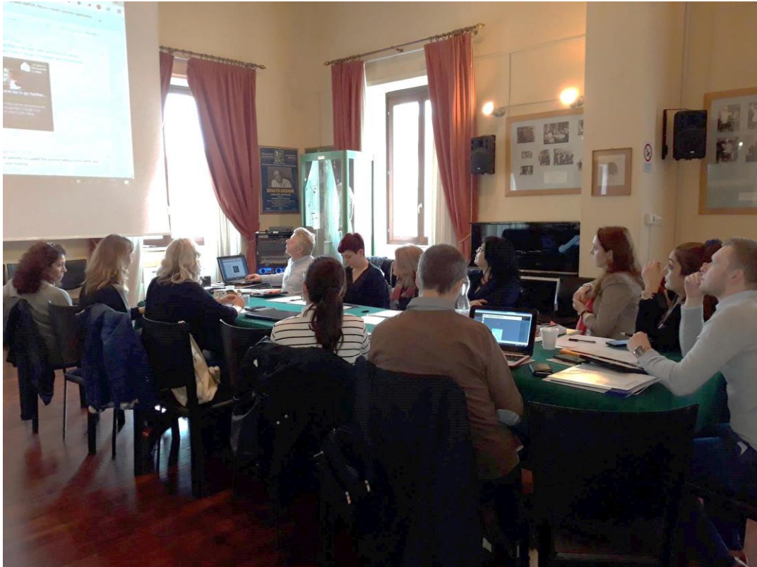
Photo 2 - Project partners discussing the dissemination of the project during the third project meeting in Ortona

During the meeting, the partners focused on discussion about the findings of the first Intellectual Output regarding the Career Counselling and Guidance Services provided at national, regional and local level.